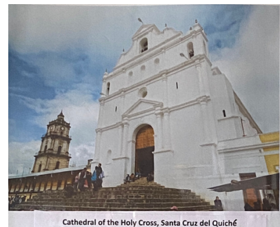
Cathedral of the Holy Cross, Santa Cruz del Quiché